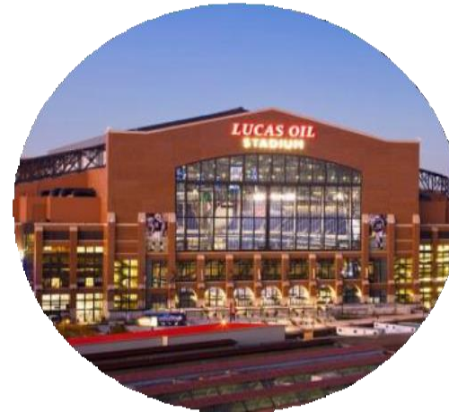
Lucas Oil Stadium