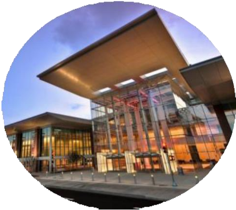
Indiana Convention Center